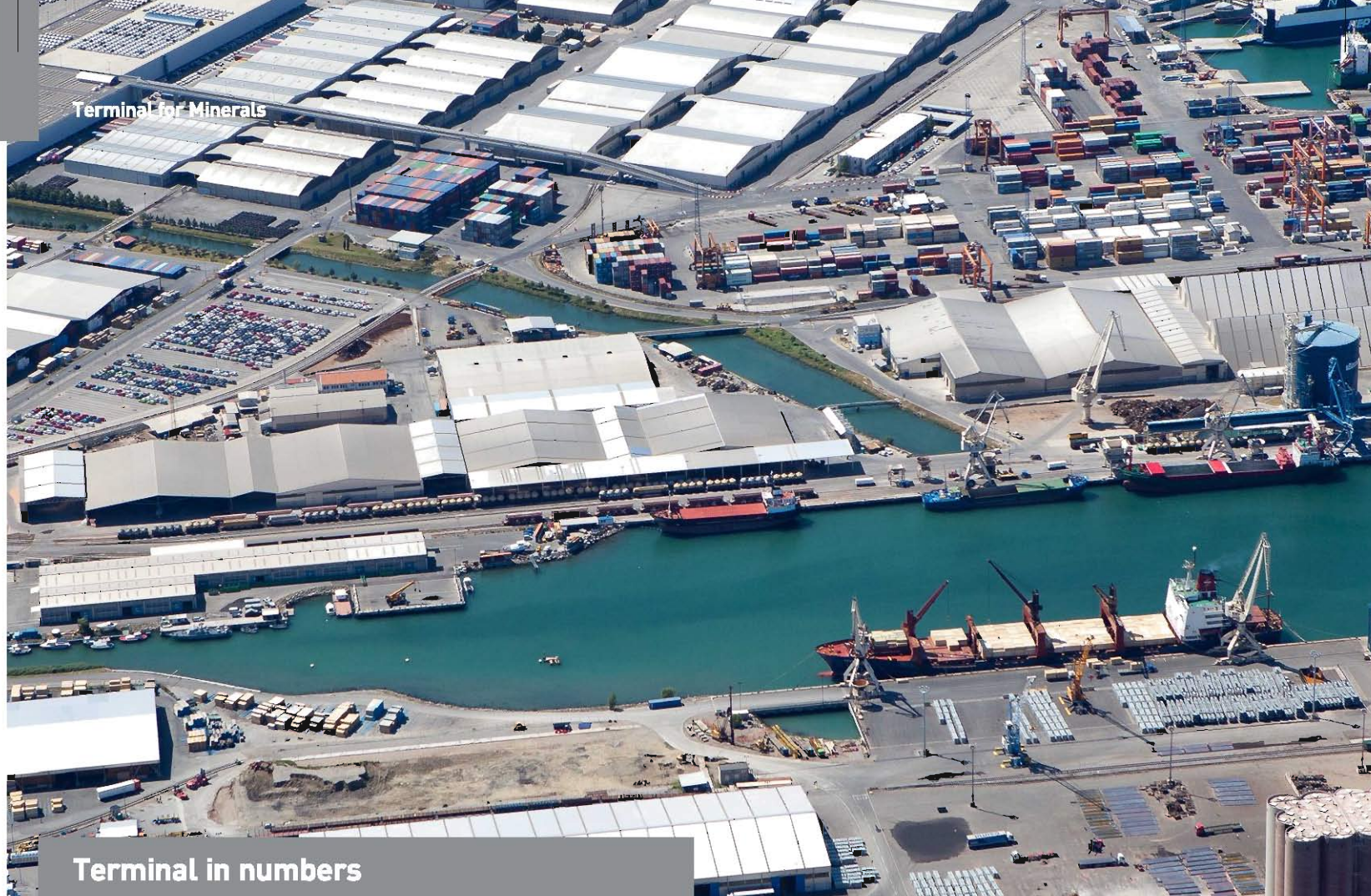
Terminal for Minerals